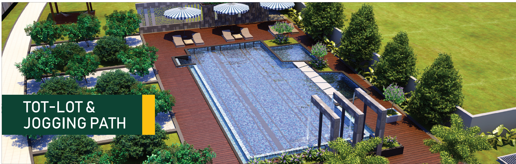
TOT-LOT & JOGGING PATH