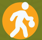
Colleyball & Basketball Court