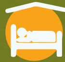
Suite Rooms with in Club House